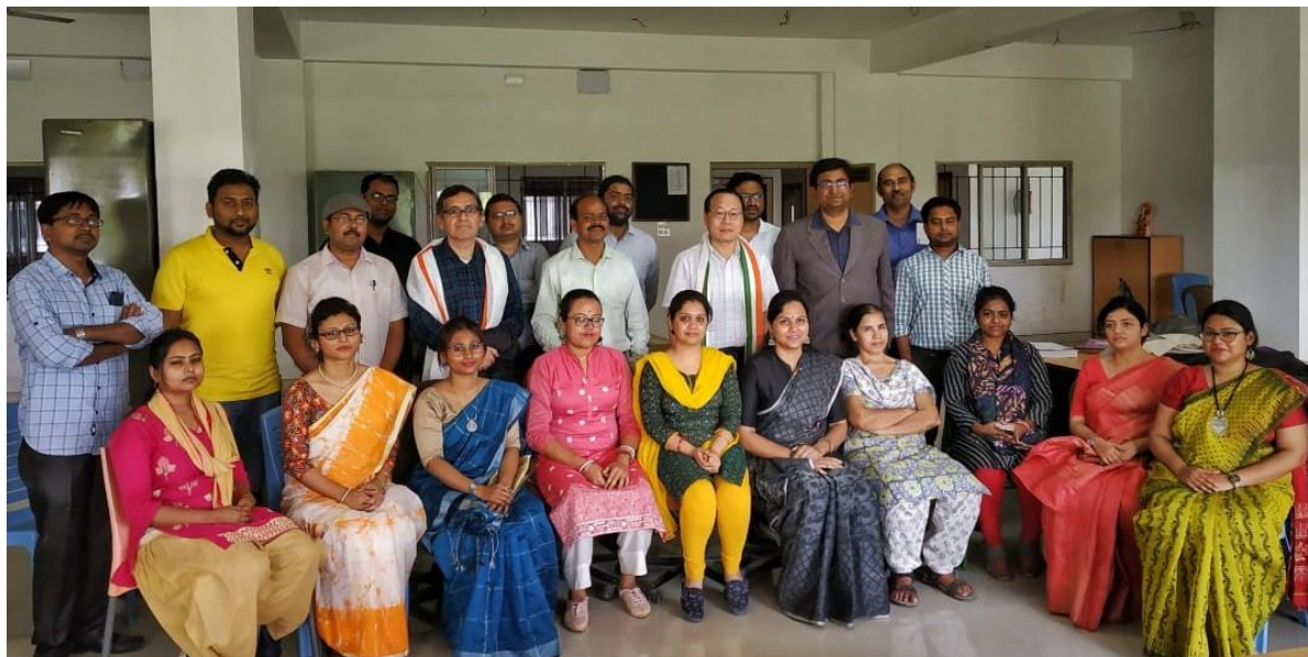
Guests with Organizing Committee Members